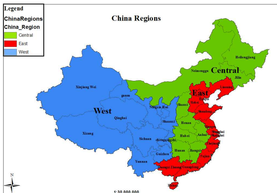
Figure 2: A regional division of China's energy system in East, Central and Western Regions