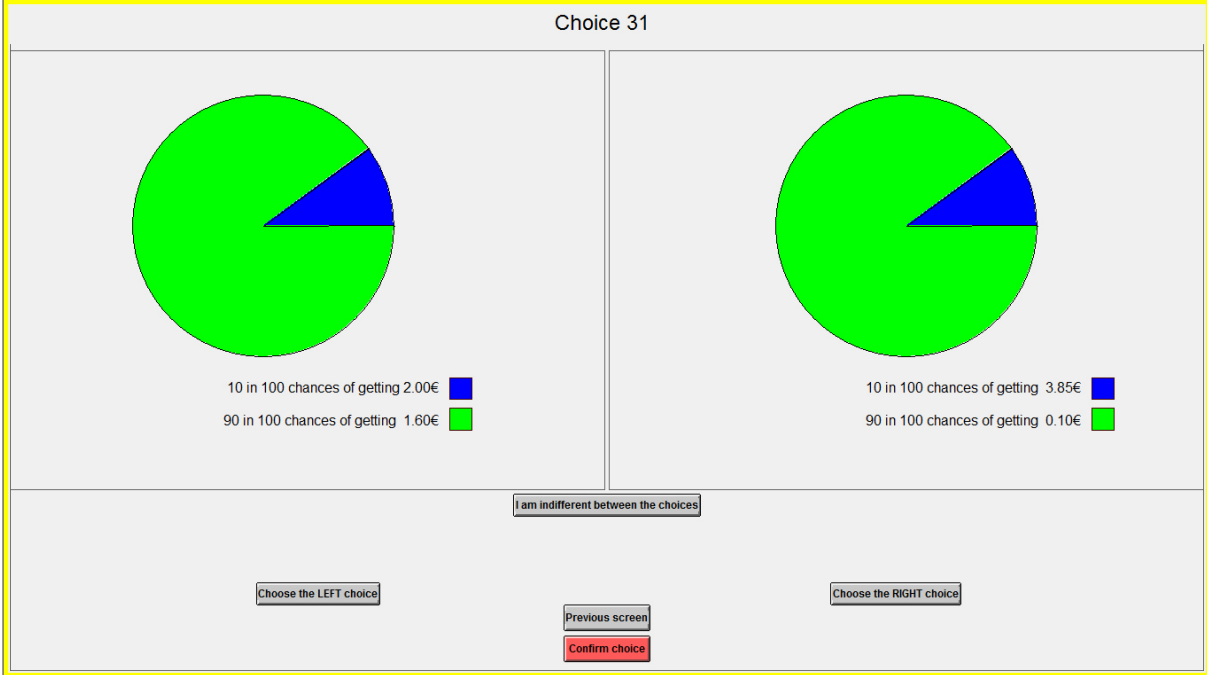
Figure 1: Example Decision Task

was effectively inaccessible. The order of appearance of the treatments for each subject was completely randomized to avoid order effects (Harrison et al., 2005). An example of one of the decision tasks is shown in Figure 1.