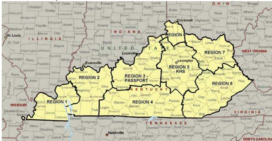
November 1997-June 2000 – 37 Counties under MMC, 83 under FFS.