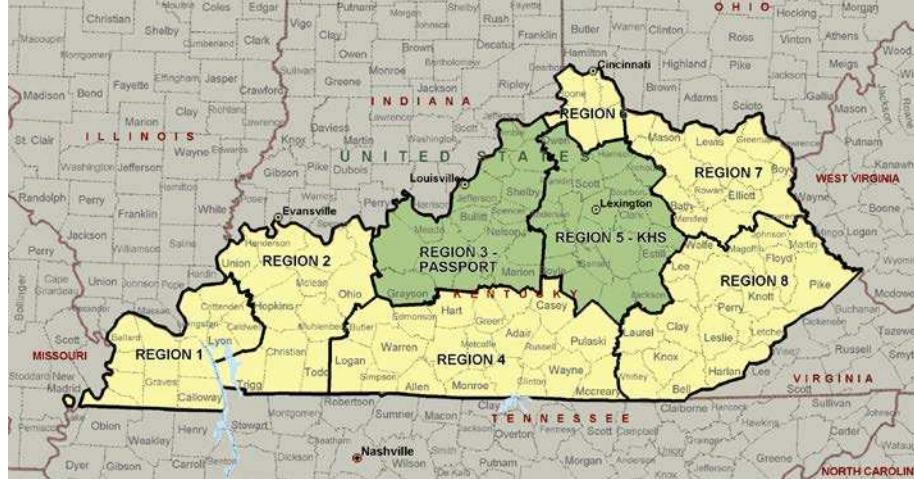
July 2000-December 2003 – 16 Counties under MMC, 104 under FFS