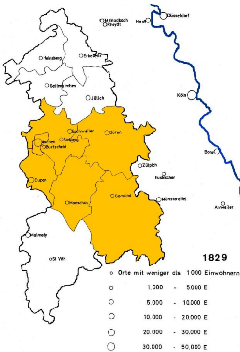
Map 2: Industrial district of Aachen, counties with a majority of industrial employment

Note: The county of Gemünd became later county of Schleiden.