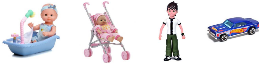
Figure 2. Pairs of goods presented to the little girls and boys. doi:10.1371/journal.pone.0109520.g002

should receive more affirmatives than question 3. Question 1 addresses the possession of the borrowed toy. Question 2 involves a favorite toy that does not necessarily coincide with the one brought from home. Question 3 involves a hypothetical trade for a future Christmas present. For these reasons, trades were actually executed only for Question 1 in the cases where children accepted the deal. After the children answered these questions, the experimenter measured their digit ratios, assessed their handedness, and marked their gender. The 2D:4D ratio was measured by the experimenter after tracing the contour of each child’s right hand on a sheet of white paper.