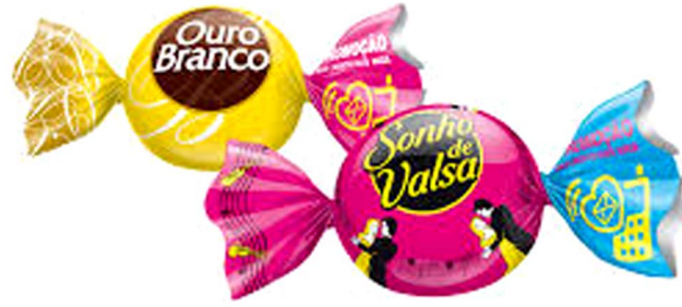
Fig. 1. Candies used in the experiment.