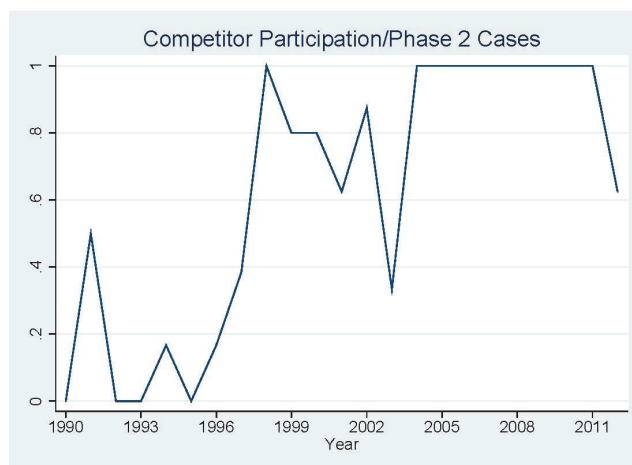
Figure 1: Competitor participation as a share of Phase 2 cases, EU, 1990–2013

We have looked into all Phase 2 proceedings between 1990 and 2013 and identified those cases where competitors were given the opportunity to voice their opinions. 18 As can be seen in Figure 1 which plots the ratio between competitor participation and Phase 2 cases, competitor involvement has radically increased since the reform and the ratio has stayed continuously at 1. One can assume presently that all Phase 2 proceedings will entail the involvement of competitors, whereas in the past that was not necessarily the case.