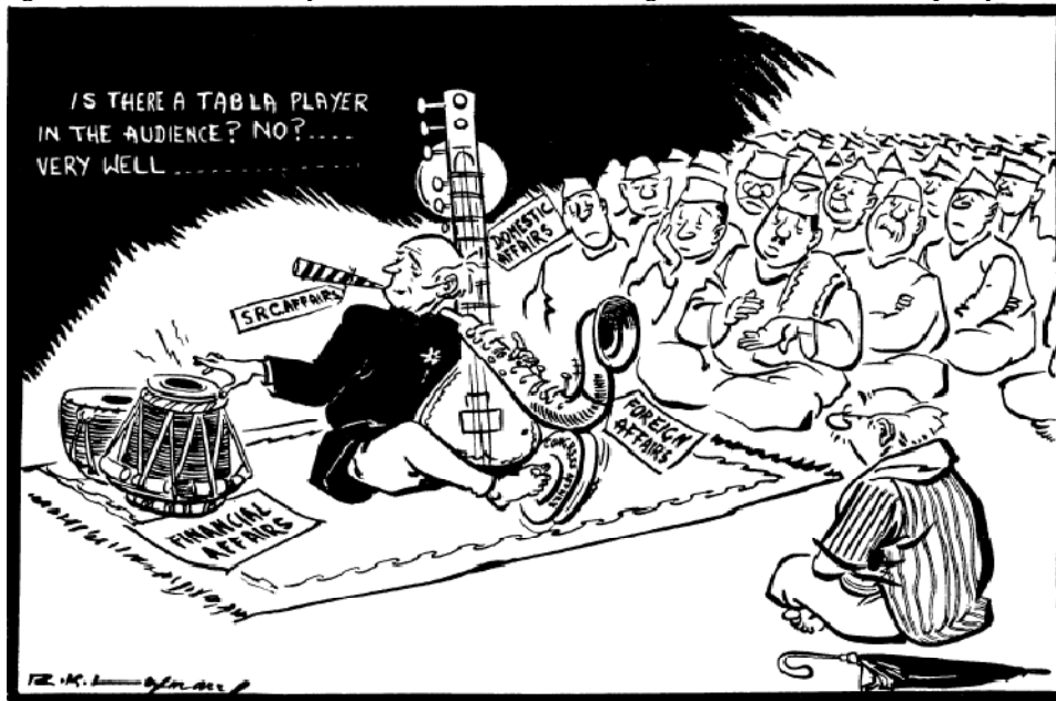
Figure1: A famous cartoon by R. K. Lakshman demonstrating Nehru's dominance over policy making

The term also does not imply that all the components of the so called 'Nehruvian Consensus' were exactly as Nehru would have wished them to be. In fact, Nehruvian consensus in many crucial areas [as demonstrated in the third part] was a product of intense bargaining with and eventual accommodation of the influential interest groups, somewhat to Nehru's own discomfiture.