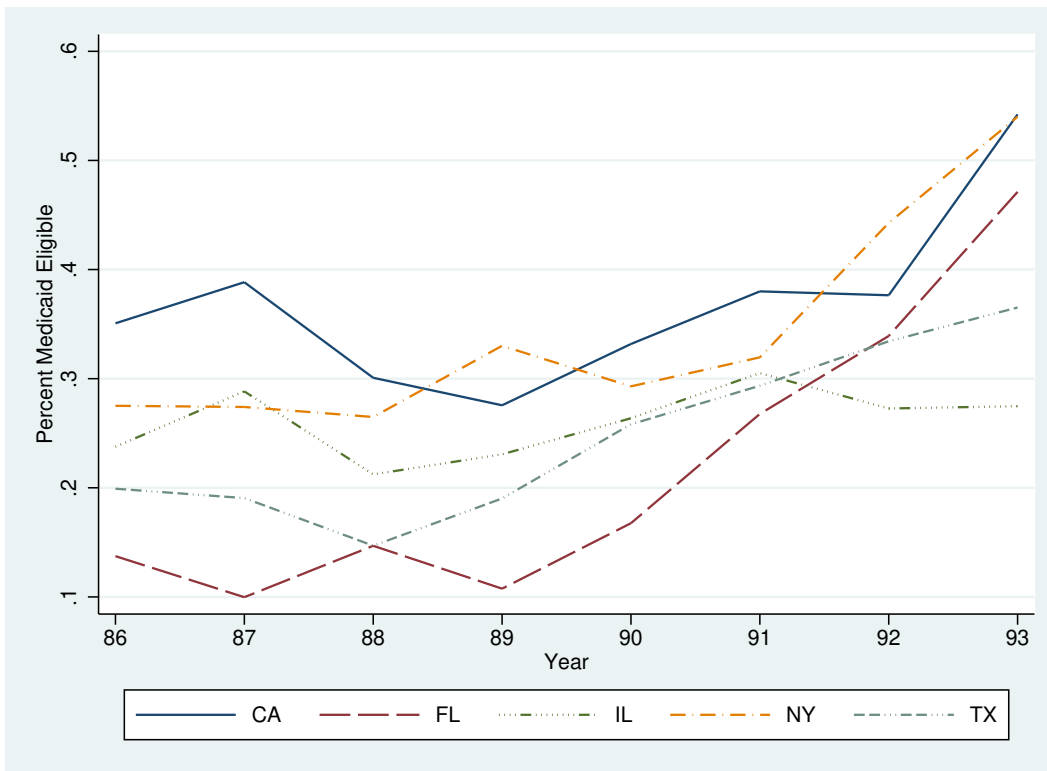
Figure 1: Expansion of Medicaid eligibility for children under 21 for the five largest states. Estimates are for March of each year and are weighted using person-level, cross-sectional weights for the month of reference.