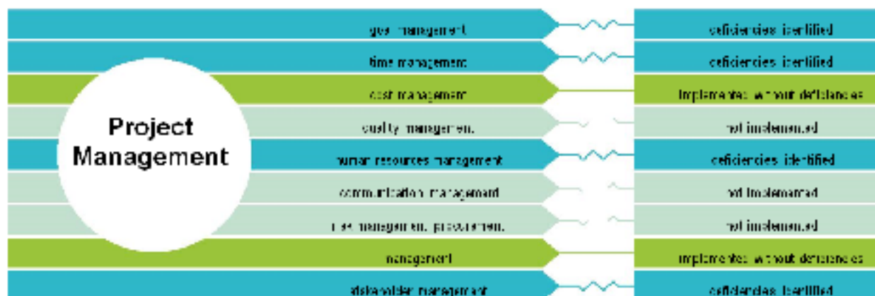
Fig.4 Project management effectiveness in the management of the project "Development of Infrastructure on Krievu Island for the Transfer of Port Activities from the City Centre"

By failing to timely control the use of the territories intended for the Project the Authority has spent funds of at least 1,012,467 euro for covering the costs of demolishing open-plan warehouse buildings built by the merchant during the implementation period of the Project on the land parcel where construction work for the Project was planned. Failing to comply the regulatory enactment the Authority has employed outsourcing providers for tasks which are among the duties of its employees, therefore unlawfully spending funds of at least 611,888 euro