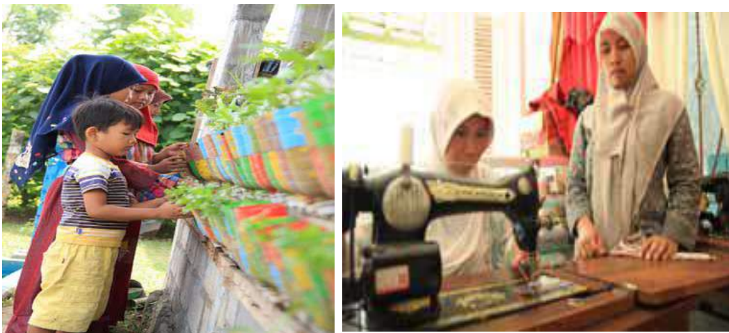
Figure 4. Smart House Pijoengan-BAZNAS (BAZNAS, March-April 2013)