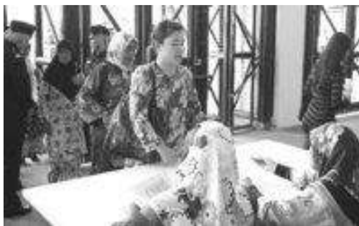
Figure 5. Zakah Management for Empowerment of the Poor (The Brunei Times, January 19, 2009).

Zakah management's role in contributing to the economy of Brunei Darussalam has long been underestimated. The recent call by His Majesty for an effective zakah distribution has been very well received by the people of Brunei. A few solutions are recommended and the development of a new social model are highlighted that can be exercised by the Institution of Zakah in Brunei Darussalam to achieve the objectives of Syariah as part of its role in eradicating poverty in the country in the next decade. Some recommendations are laid out as follows: management approach increased awareness, empowerment of the poor.