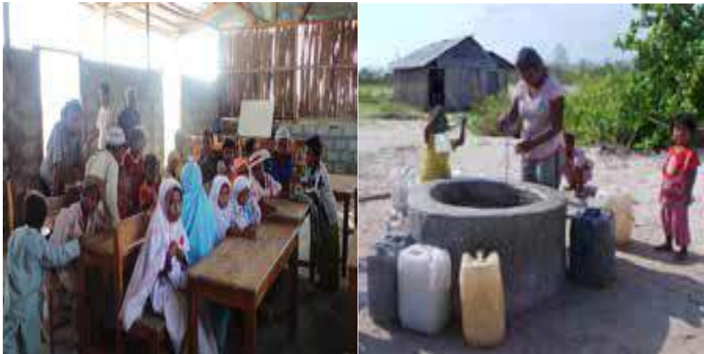
Figure 3. Zakah Mission Community Development at Monkey Island