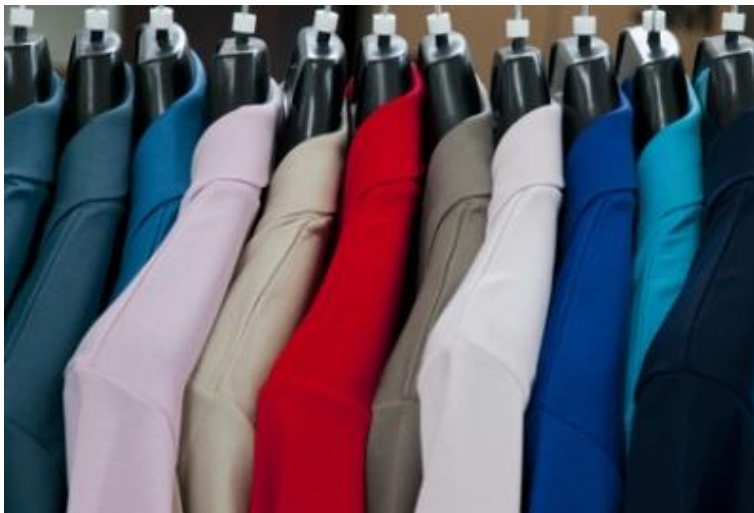
Figure 1. Indonesian Product of Textile (Global Business Guide,2014)

Textile and textile product successfully invested for new factories. Figure 1 represented the textile products exported and competed with other countries products..