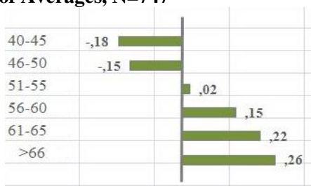
Figure 2 Workplace Discrimination Index Z Scale, Comparison of Averages, N=747