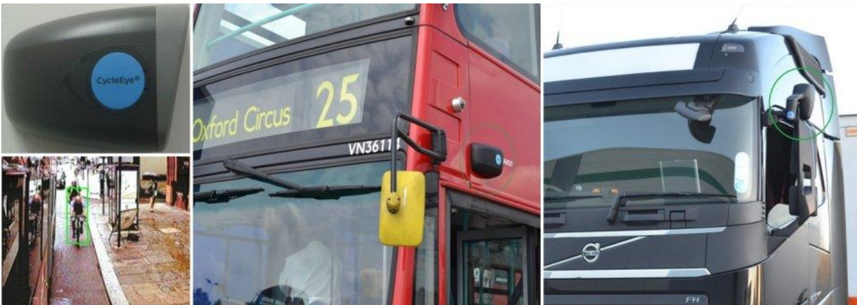
Figure 2: CycleEye – Collision Avoidance [6]

CycleEye app, a collision avoidance system developed by Fusion Processing, aims to alert drivers of buses, coaches and cargo carriers regarding the existence of a bicyclist in the proximity of their vehicle, thus helping to avoid an accident. The technology is based on camcorders placed outside of large-sized cars, cycling sensitive cameras – in other words, it identifies the bicyclist, with great accuracy, from the rest of the traffic participants [6].