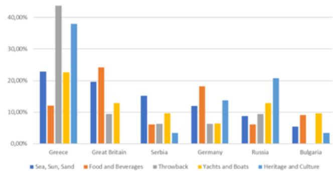
Table 1. Analysis by Preference

and Oceania are only beginning to become familiar with the region. The largest group of tourists derives from Germany, followed by Russians, British, Turks, Serbians, Romanians and Bulgarians. All of these ethnic groups appear in the findings of the study, after being segmented on the basis of their holiday preferences.